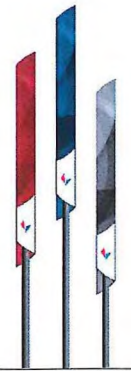
Supplemental Gateway Flags