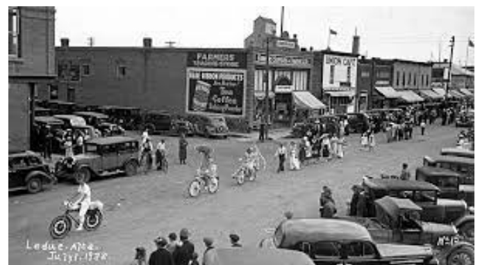
Leduc, Alberta - July 1, 1938