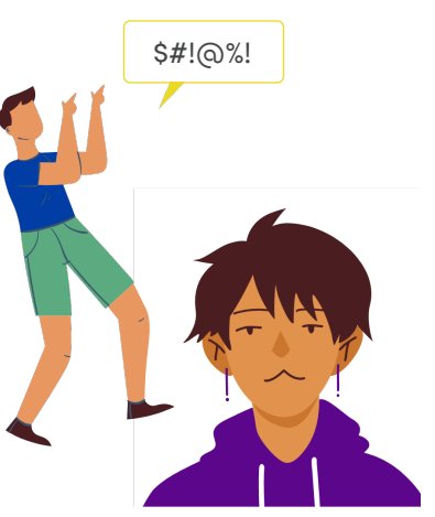
Refuse to react or laugh