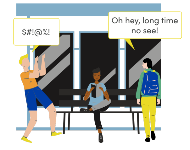
If you witness discriminatory harassment in a public setting such as public transport, pretend that you know them so that they don't appear to be alone.