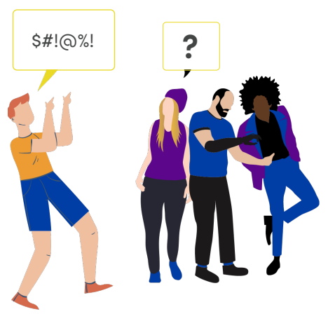
Give a questioning glance

Use non-verbal signals to indicate that you do not comply with the discrimination.